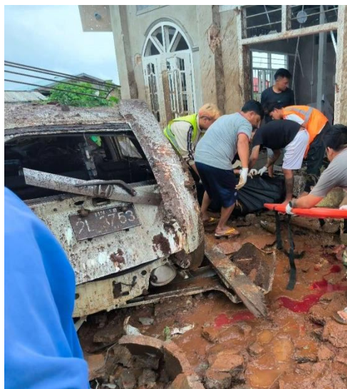
Civilian killed by SAC airstrike in Kyaukme town

On July 8, at 9:10 am, a SAC jet fighter dropped two 500-pound bombs on Gaung Ubar village section of Mogok town, killing three civilians, injuring five others, and damaging ten houses and a private school.