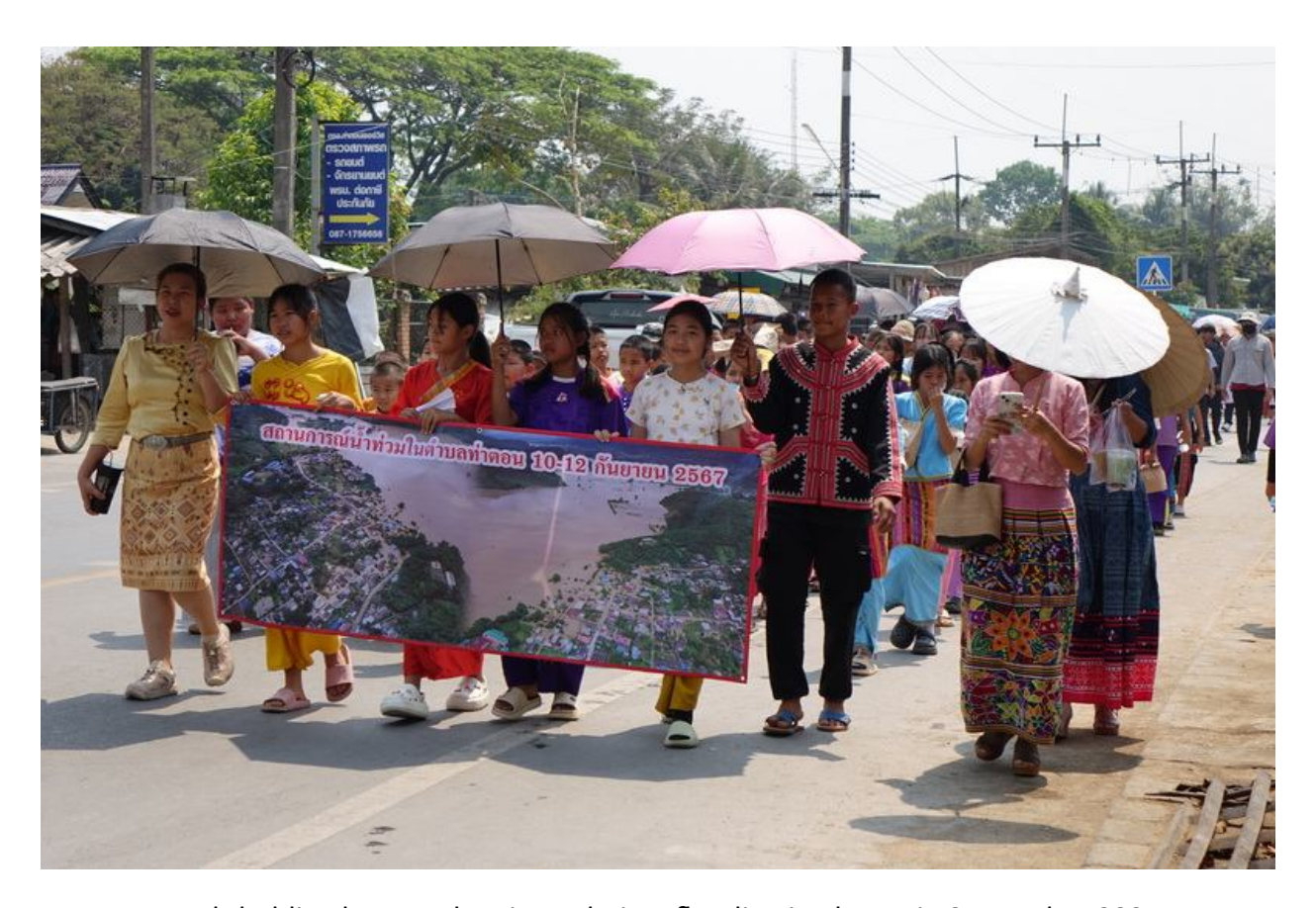
Locals holding banner showing Kok river flooding in Thaton in September 2024