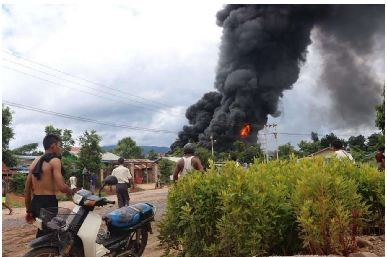
SAC airstrike on petrol storage tank in Kyaung Suu village near Chinese pipelines

From August 12 to 19, SAC continued relentless air and artillery attacks in Hsipaw town and surrounding villages, inflicting further civilian casualties and damaging scores of buildings. Airstrikes on August 14, 15 and 19 damaged buildings in Na Loi and Kyaung Suu villages next to the Chinese pipelines – including a factory petrol storage tank at Kyaung Suu which caught fire only 250 meters from the pipeline control station.