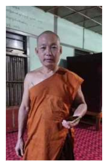
Sao Nandicena killed by SAC airstrike

Nawng Kaw temple, renowned for its scenic lakeside location, is situated about 1 km from the SAC IB 147 base, which had been under attack by the MNDAA since the last week of July.