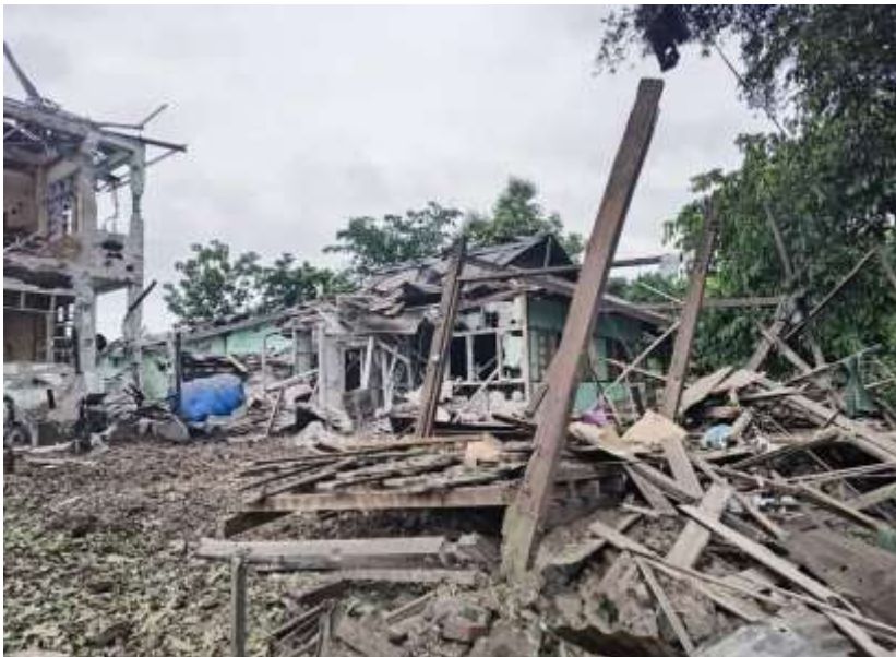
School building destroyed by SAC airstrike

On July 25, an aerial bomb left a huge crater in Quarter 2 of the town, damaging ten houses. The size of the crater appeared to be larger than that of a 500 pound bomb.