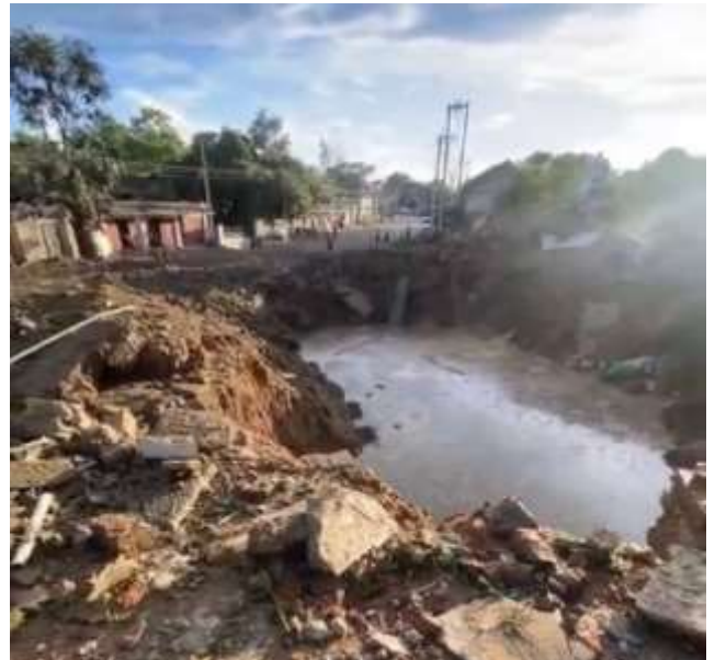
Huge crater caused by SAC bomb