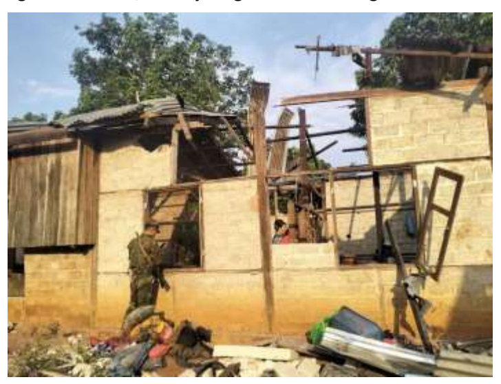
Local villager's house damaged by SAC shell in Thonze village

On May 10, at around 8 pm, SAC troops stationed at Oom Mark Dee village indiscriminately shelled into Thonze village even though there was no fighting. The shell damaged a house, killing a man and a woman aged around 30, and injuring four other villagers.