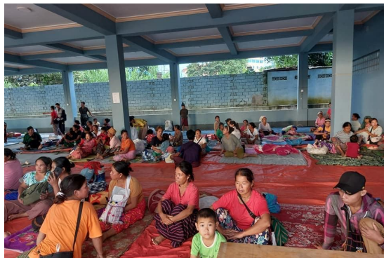
IDPs fleeing shelling and fighting

In the evening of August 29, SAC troops shelled into Selan village after TNLA troops entered the village. Shells hit a kindergarten, causing it to catch fire. That night at around 8 pm, the SAC troops shelled into Phai Kyaung village, Selan village tract. The shells hit several houses, a car and a ploughing machine, burning them to ashes.