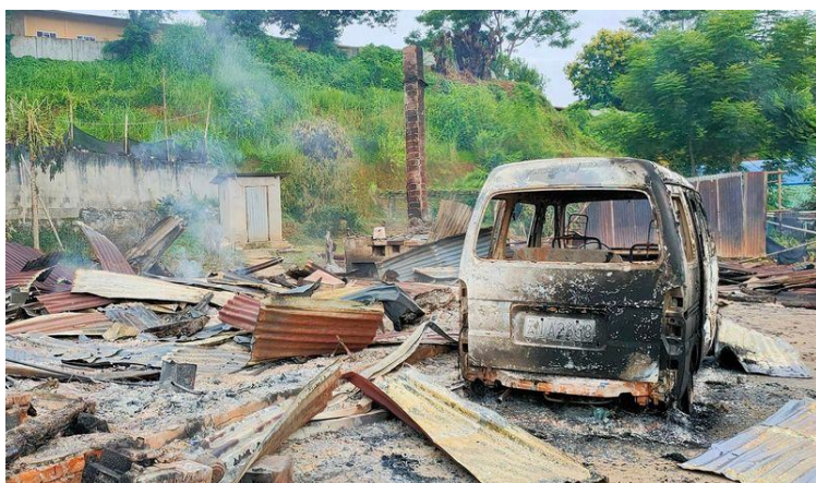
Villager's property and car destroyed by shelling in Selan

On August 29 at noon, SAC launched three airstrikes over Loi Tay Mong mountain and Selan village. Bomb shrapnel hit a 30-year-old man and a 50-year-old woman in Selan village, injuring them in the neck and thighs.