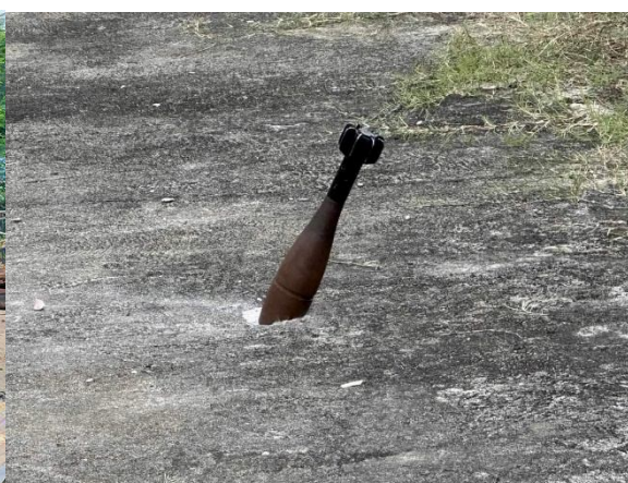
Unexploded shell in Selan