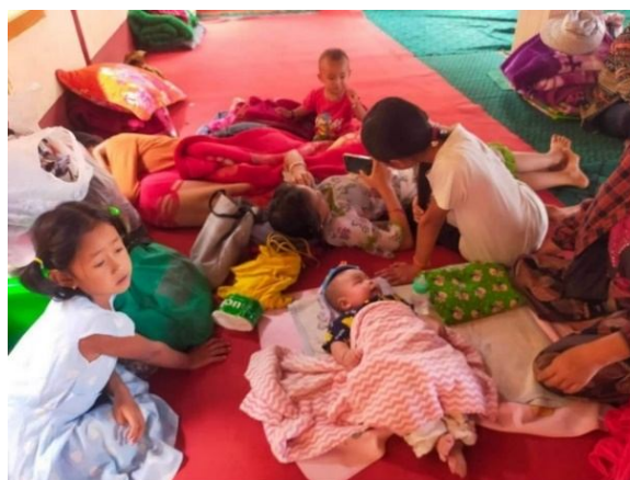
IDPs sheltering at local temples