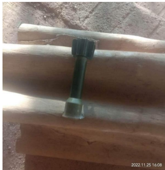
Unexploded Burma Army shells in Koong Sar village

Terrified by the fighting and shelling, about 700 villagers fled from their homes in Koong Sar and nearby villages. Some took shelter in village temples and churches, and some in temples in Hsipaw town.