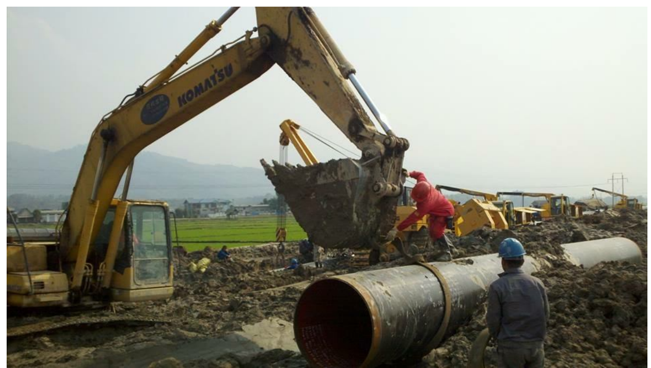
Oil and gas pipelines being laid in N. Shan State in 2012

A third of the 800-kilometer pipeline route from the Arakan coast to the China border crosses northern Shan State. Construction of the pipelines from 2011 and 2013 caused large scale disruption of local farming livelihoods, and in 2013, the Northern Shan Farmers' Committee submitted a petition to the Shan State chief minister calling for the project to be stopped, but this was ignored.