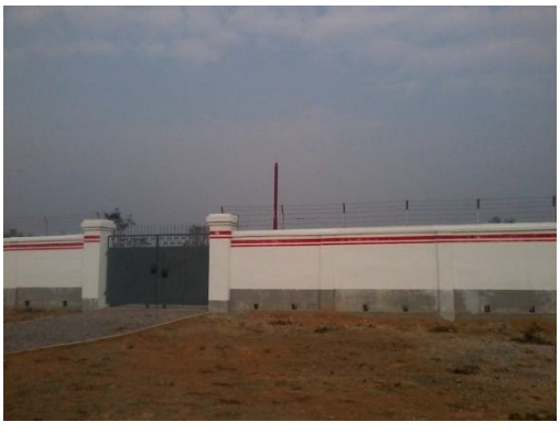
Pipeline pumping station near Nawng Arng

The sergeant informed the headman that landmines had been laid in wooded areas near the pumping station, on the west and east of the Lashio-Mandalay highway, and that villagers should avoid these areas.