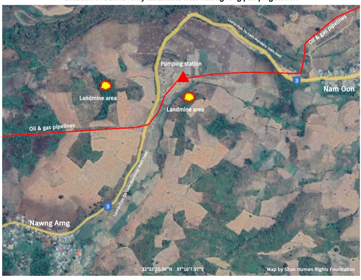
Location of Burma Army landmines near Nawng Arng pumping station