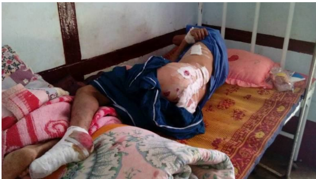
Villager injured by mortar shrapnel in Wan Mark Hoo on Oct 4, 2014