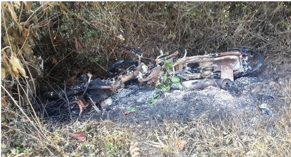
Motorcycles burned by Burma Army troops after killing two villagers on road to Murng Yai on Oct 3, 204

The two men were riding their motorcycles on the road from Wan Boong village to Murng Yai to buy buffaloes when they were shot at by Burmese troops near Loi Kio Jee. After they were killed, the Burmese troops set fire to the motorcycles.