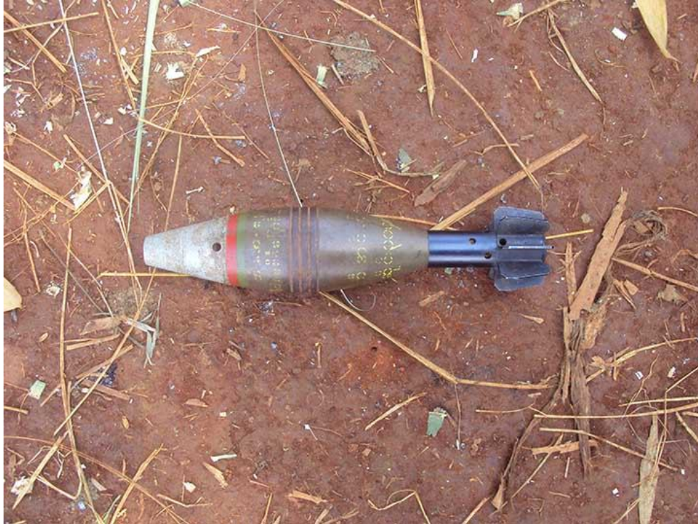
Unexploded 60 mm shell in Wan Mark Hoo