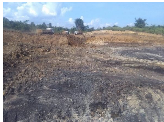
large scale clearing for coal

On October 17, 2019, Thai company representatives came to Mong Kok and held a meeting with villagers at Kyaung Wan Weng temple from 3 pm to 5 pm. They told villagers that they would only do “testing” of coal first, starting on October 25, 2019. However, it is clear from the scale of digging since then, with large areas cleared and coal heaped in large piles, that this is more than mere “testing.”