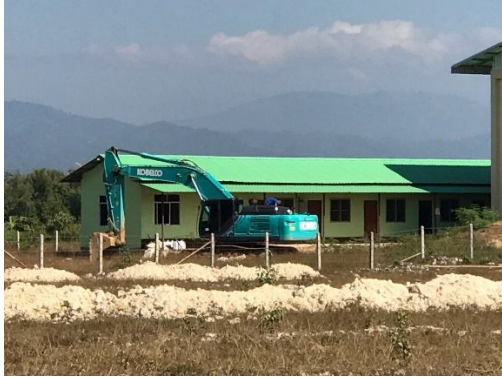
Company workers' camp

Thai company staff say that the coal will be transported by road from Mong Kok through Mong Loong and Mong Hai to Taw Kaw in Tachileik, from where it will be transported across the No. 2 Friendship Bridge to Maesai in Thailand.