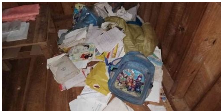
House ransacked by Burma Army